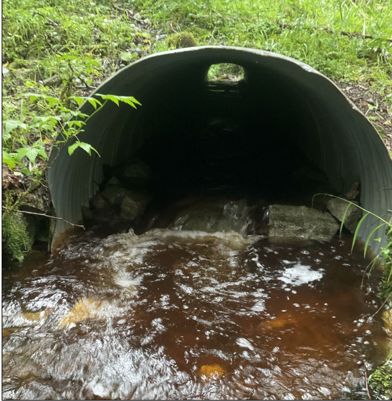
Figure 1.—Culvert at waypoint 1525.