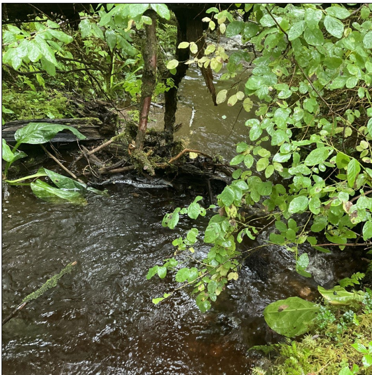
Figure 2.—Channel at waypoint 1528.